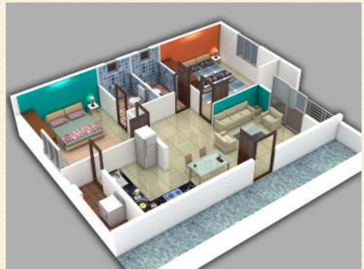
2BHK : 1284Sft East Facing