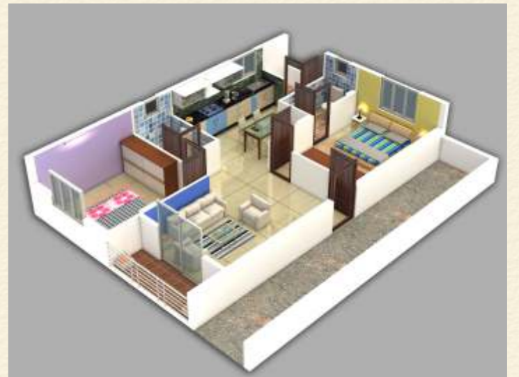
2BHK : 1111Sft West Facing